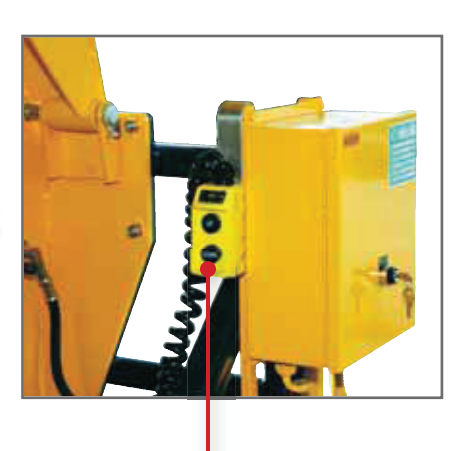
Easy to Use Pendant Control (standard on all C/I Taskmaster Series)